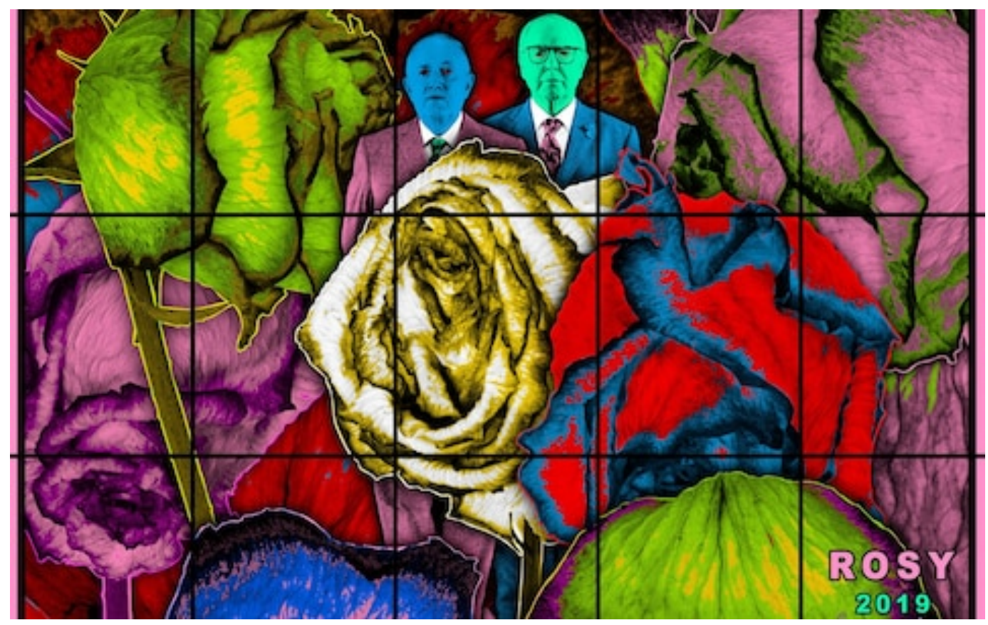
Rosy, one of Gilbert & George's psychedelic Paradisical Pictures from 2019

Unsurprisingly, given their antiquarianism, the renovation of the 19th-century building is everywhere on point. Details, including bespoke oak furniture and solid-bronze handrails, will delight design enthusiasts; even the Portland-stone-clad lavatories nod to Christ Church, Spitalfields, down the road. I was won over as I locked my bike to a rack resembling, at the artists' insistence, a Gothic arch.